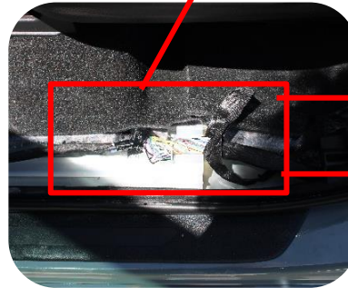
Keyless Wire Location